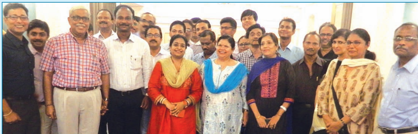
Participants of CTRFPF training workshop on 'Fiscal Issues and State Finances' held during 20-22 August, 2015