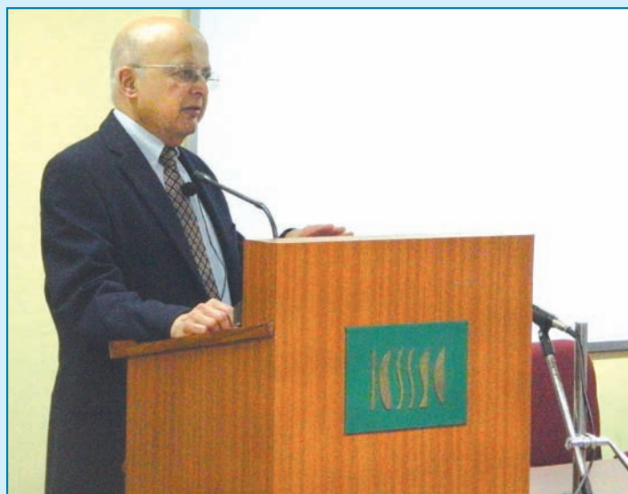
Prof. Avinash K. Dixit, Princeton University delivering R. C. Dutt Memorial Lecture. He visited CTRFPF during the period 16th to 21st December, 2015

Papers are available to download at http://www.ctrpfp.ac.in/wp.htm