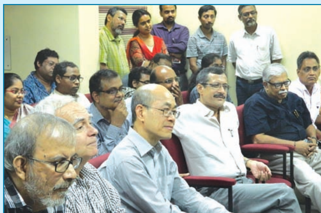
Participants attending the conference on '50 years of Simple General Equilibrium Models and Policy Implications in Open Developing Economies - Historical and Emerging Issues'

Wage Inequality and Capital Accumulation: A Dynamic Analysis).